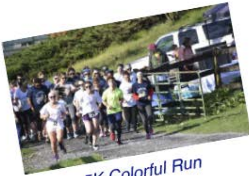
5K Colorful Run