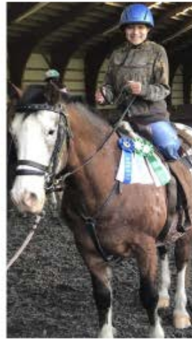
Student Horse Show