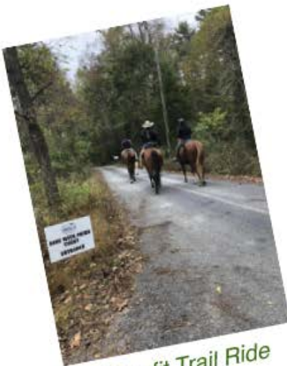
Benefit Trail Ride