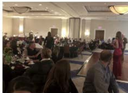
Yearly Dinner & Auction